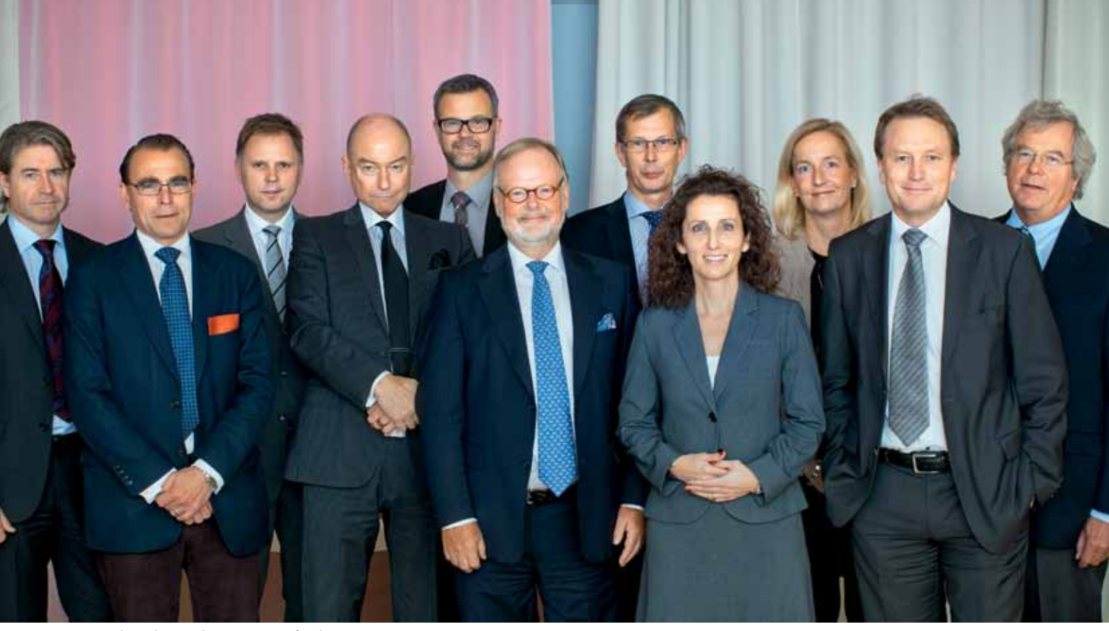
Board members and management of Hakon Invest.

of compliance with applicable laws and regulations, ensuring that ethical rules for employee conduct are adopted and approving significant assignments held by the president outside the company. The Board shall also ensure that the provision of information is correct, relevant, reliable and transparent.